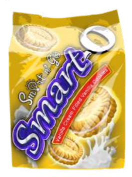
Smart-O Vanilla Cream Filled Vanilla Cookies