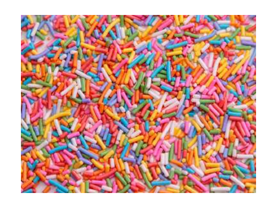
Vermicelli, Sprinkles, Toppings