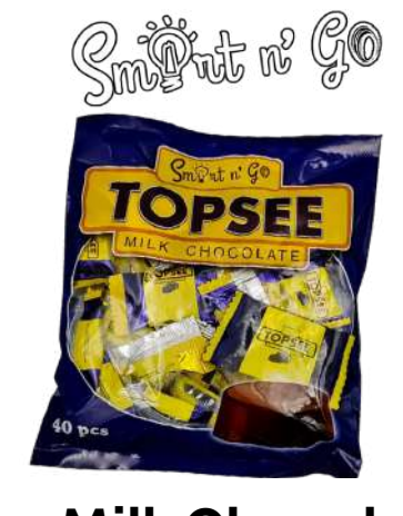
Topsee Milk Chocolate Sizes: Pack of 10pcs and Pack of