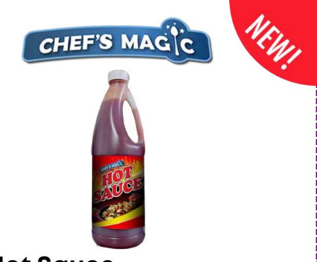
Hot Sauce Sizes: 1kg