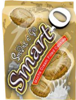
Smart-O Mocha Cream Filled Cookies