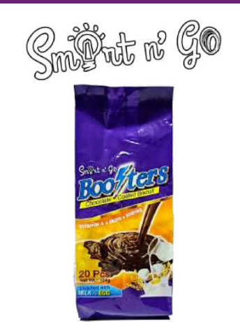
Booster Sizes: Pack of 20pcs and Pack of