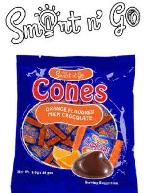
Cones Orange Flavored Milk Chocolate