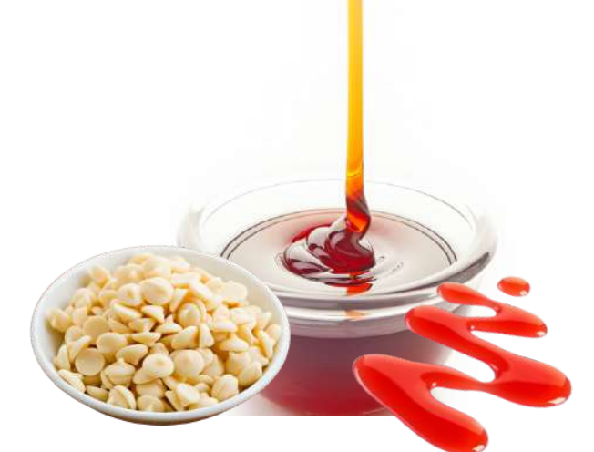
Syrups, Fillings, Toppings and Coatings