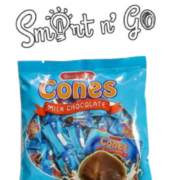
Cones Milk Chocolate Sizes: Pack of 10pcs and Pack of 40pcs