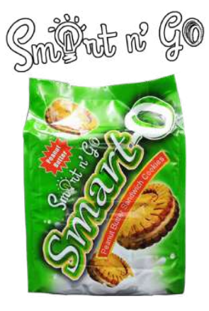
Smart-O Peanut Butter Sandwich Cookies