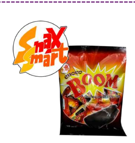
Boom Sizes: Pack of 20pcs