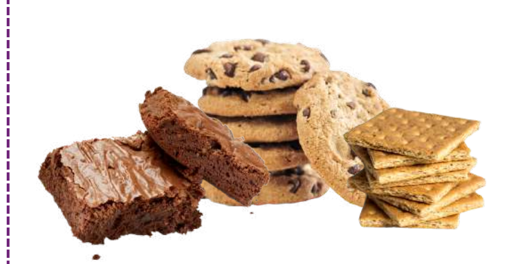
Brownie Bits, Graham Fines, Graham Bits, Cookie Cluster Fines, Cookie Cluster Bits