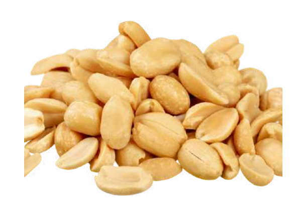
Nuts Diced Roasted Peanuts, Peanut Fines, Peanut Bits, Peanut Paste