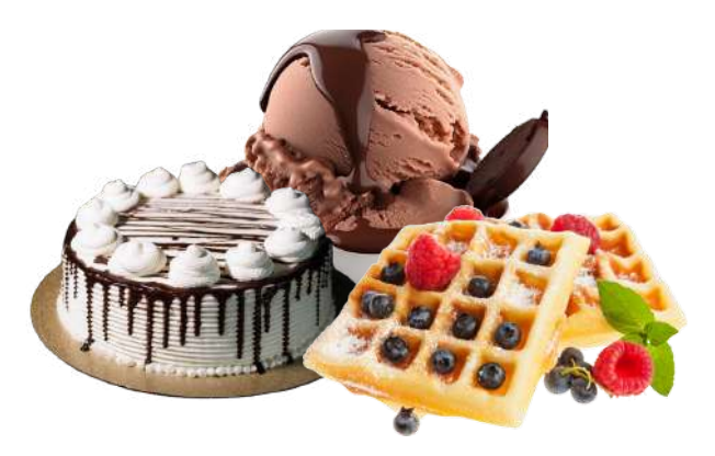
Ice Cream, Waffle, Cake Premix