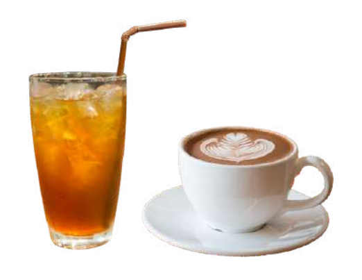
Powdered Drink Mix Blue Lemonade, Pink Lemonade, Cucumber Lemonade, Red Iced Tea, 3-in1 Coffee Mix