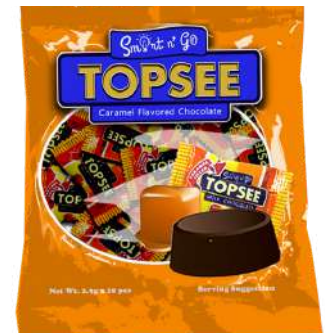
Topsee Caramel Chocolate