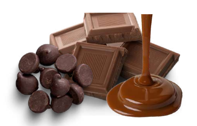
Chocolate Products Chocolate Blocks, Chocolate Droplets, Chocolate Buttons